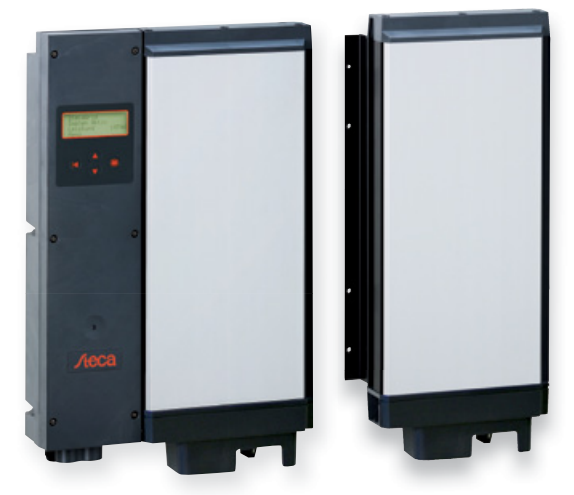
StecaGrid 2010+ Master not shown: StecaGrid 2000+ Master

To reduce the installation time, the StecaGrid 2010+ inverter has an integrated DC circuit breaker. For safety reasons, the cable cover located above the DC connector can only be removed when the DC circuit breaker is switched off.